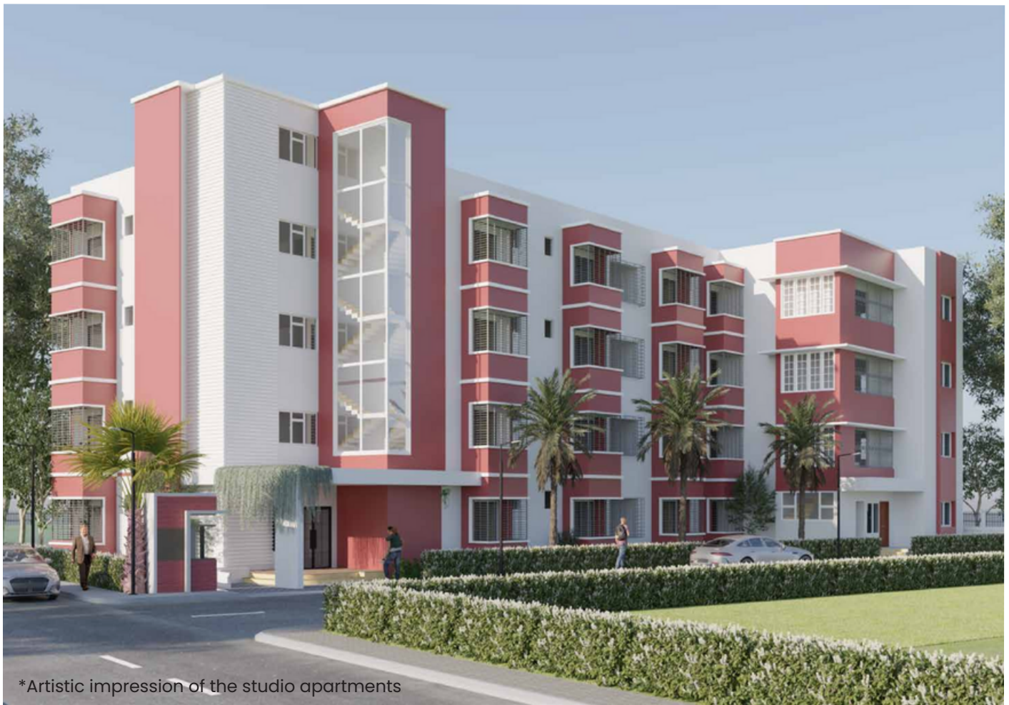
*Artistic impression of the studio apartments