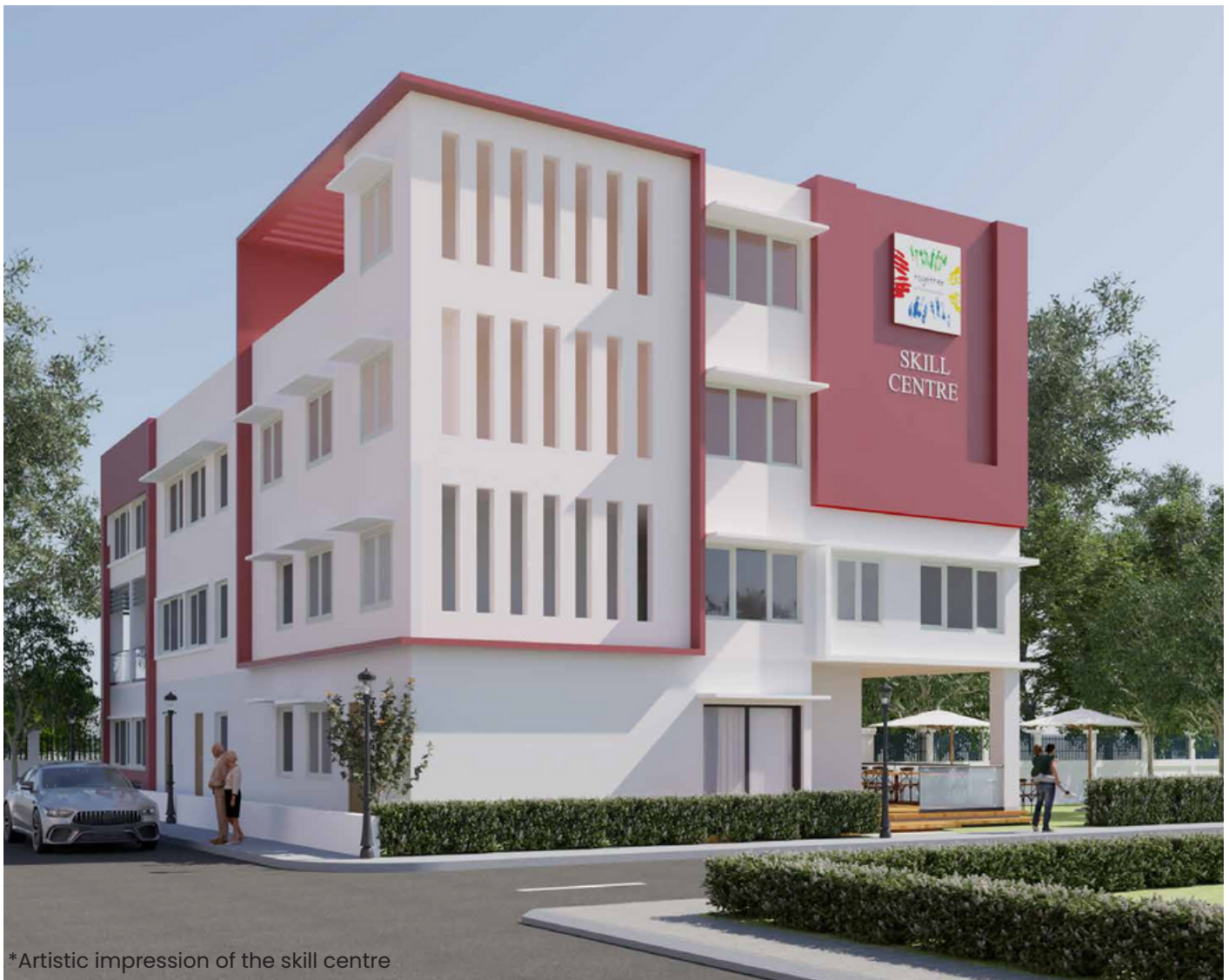
*Artistic impression of the skill centre